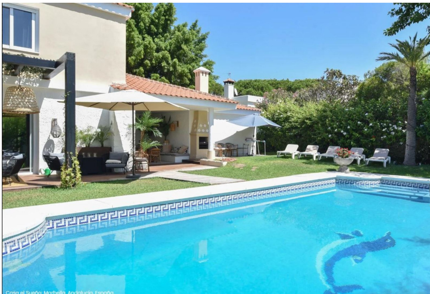
Casa el Sueño: Marbella, Andalucía, España.