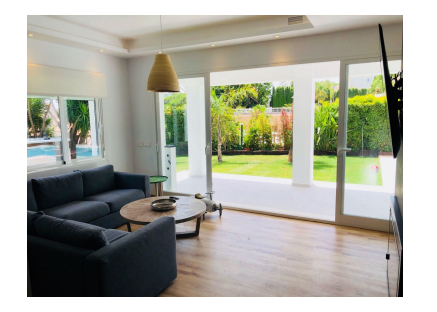
Price: 1,800,000 € Printing day : 23rd January 2025

M<sup>2</sup>: 252 Parking places: by request