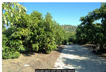
avocado plants with olive trees behind