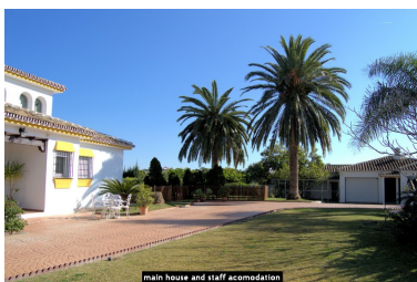
main house and staff acomodation