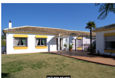
north wing and patio